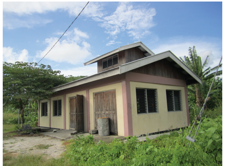
The Power House