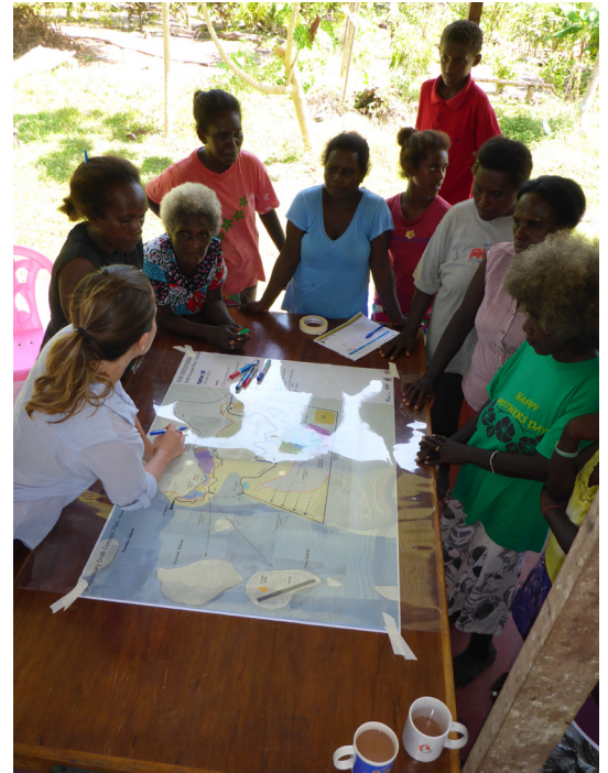
Talking to community members Supizae