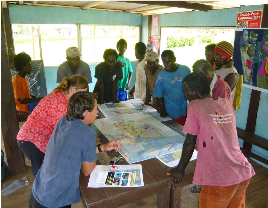
Talking to community members Poroporo

Projek team hem tok stori wantaem staka pepol kasem ova 300 man na mere taem oketa visitim vileg. Tingting blo kommuniti nao anda Lauru Provins Gavman nao lo oketa disfala buka.