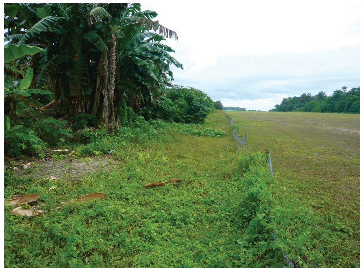
The Air Strip