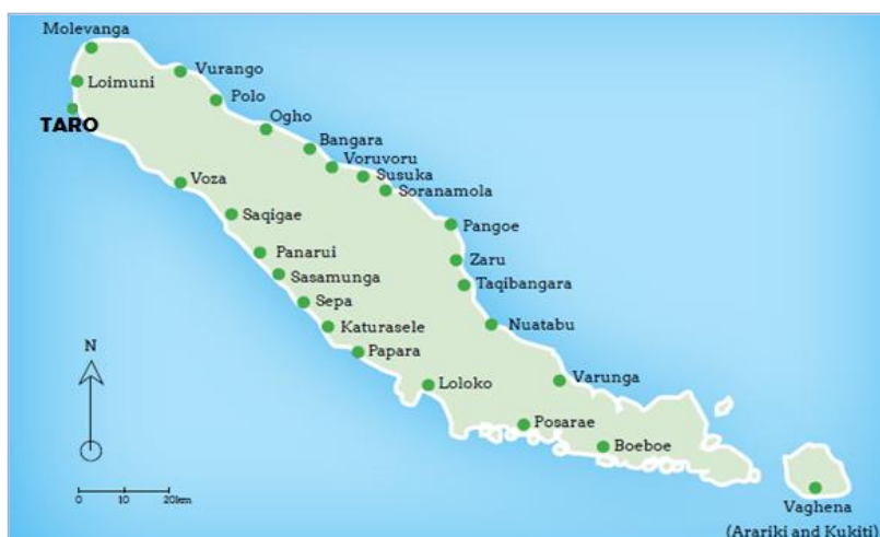
Choiseul Province communities and location of Sepa and Loimuni (from SPC/SPREP/USAID/GIZ 2013)

Qualitative analysis of possible adaptation solutions indicated that the best option was conservation agriculture in Loimuni, and a combination of contour-based agroforestry and conservation agriculture practices in Sepa.