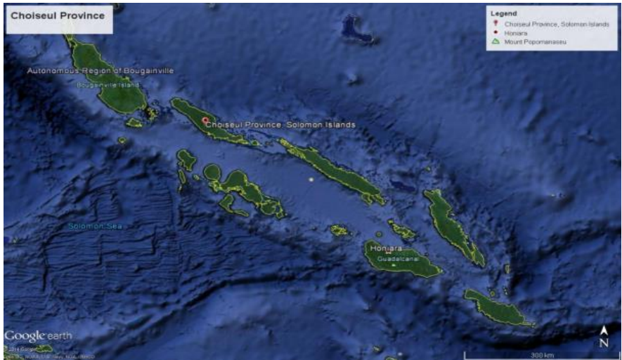
Location of Choiseul Province (Google Earth 2014)