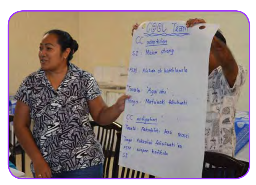
Pacific island climate change practitioner from Tuvalu presents communications group work