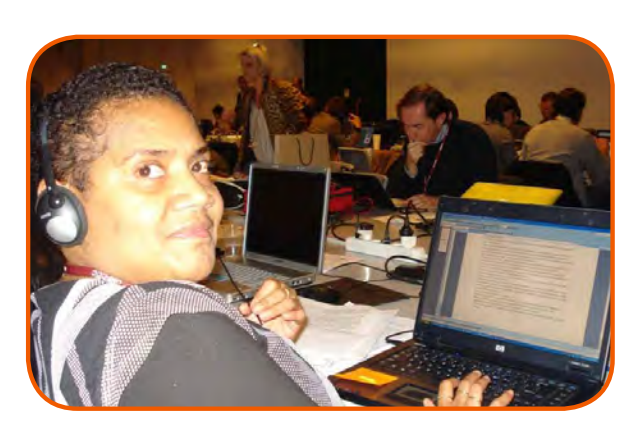
Regional Pacific reporter at work in Media Centre at the UNFCCC COP 15 (2009)