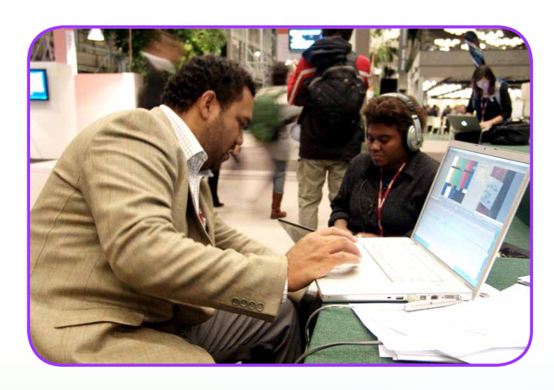
Pacific reporters from Fiji and Papua New Guinea at work during the 15th Conference of the Parties to the United Nations Framework Convention on Climate Change (2009)