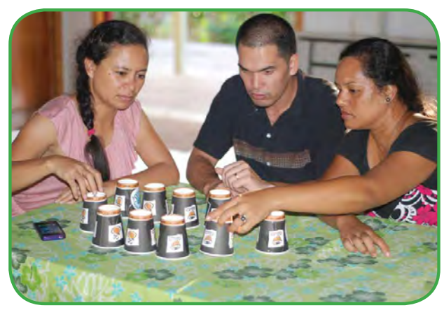
Pacific media workers from the Cook Islands learn about biodiversity through group work (2011)