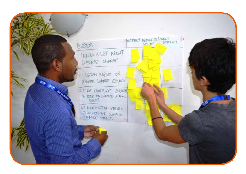
Pacific reporters from the Solomon Islands and Palau carry out self evaluation during climate change training (2010)