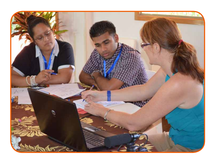
Pacific reporters from Fiji and the Cook Islands have one on one sessions with climate change staff from SPREP (2010)